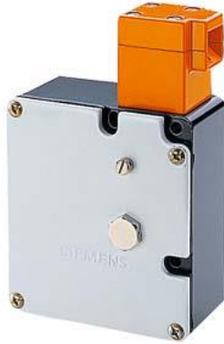
POSITION SWITCH, METAL-ENCLOSED, SPRING-ACTUATED LOCK, DC 24V, M20 X 1.5