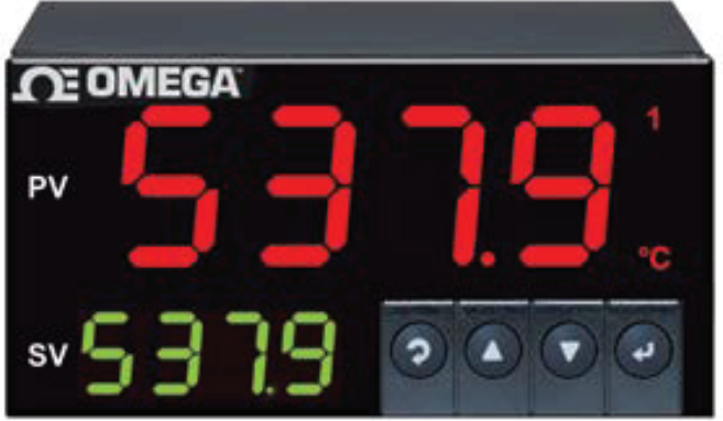
Connect your OS130A Series sensor to one of our reliable precision controller. www.omega.com/c/controllers